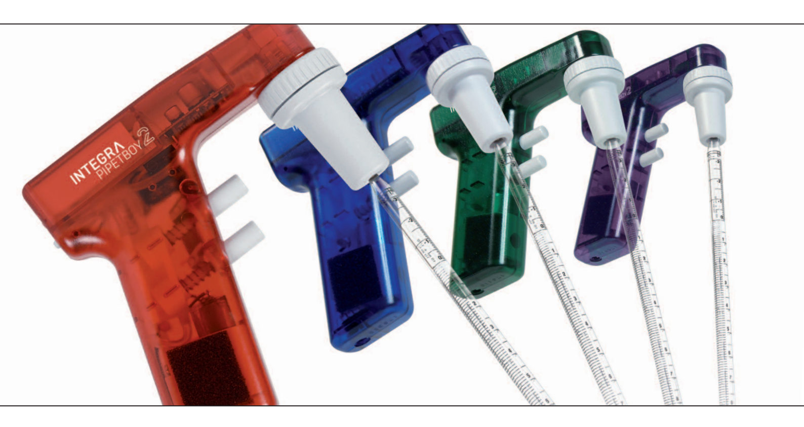
PIPETBOY acu 2 Lighter, Faster – The most popular pipettor just got better