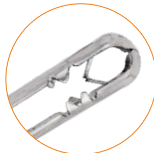
10 TEETH FOR MORE HOLD