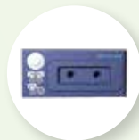
2Pin-22 mm, bipolar No. 20140-612