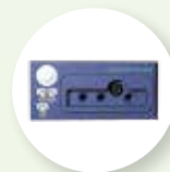
3Pin-9/5 mm, monopolar No. 20140-623