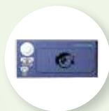
2Pin patient plate No. 20140-641