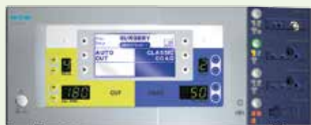
VIO 300 S VIO 200 S No. 10140-300 No. 10140-400