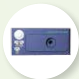
9/5 mm, monopolar No. 20140-620