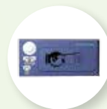
6 mm-2Pin patient plate No. 20140-642