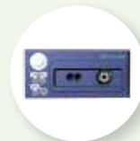
2Pin-22-28-8/4 mm, bipolar No. 20140-613