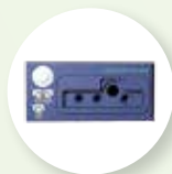
3Pin-Bovie, monopolar No. 20140-622