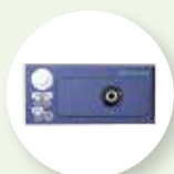
8/4 mm, bipolar No. 20140-610