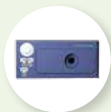
6 mm patient plate No. 20140-640