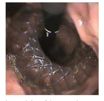
Inverted view of the stomach showing the umbrella end

The inverse view from the stomach of the distal end of the stent shows how the umbrella end clings to the gastric mucosa directly behind the cardia without protruding into the stomach. From the perspective of the oesophagus into the stent, the bulge before the cardia and the shaping of the stent in the area of the cardia can be clearly distinguished. Both guarantee excellent positional stability for the stent.