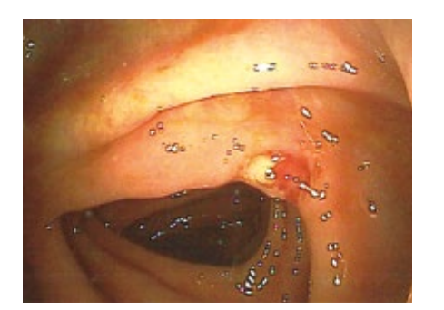
Hot biopsy forceps in endoscopic use