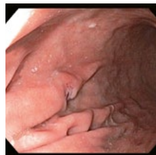
After biopsy removal