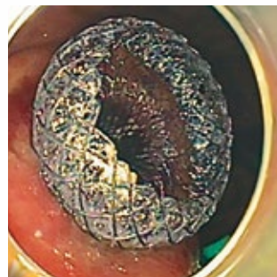
Transgastric access from stomach into pseudocyst