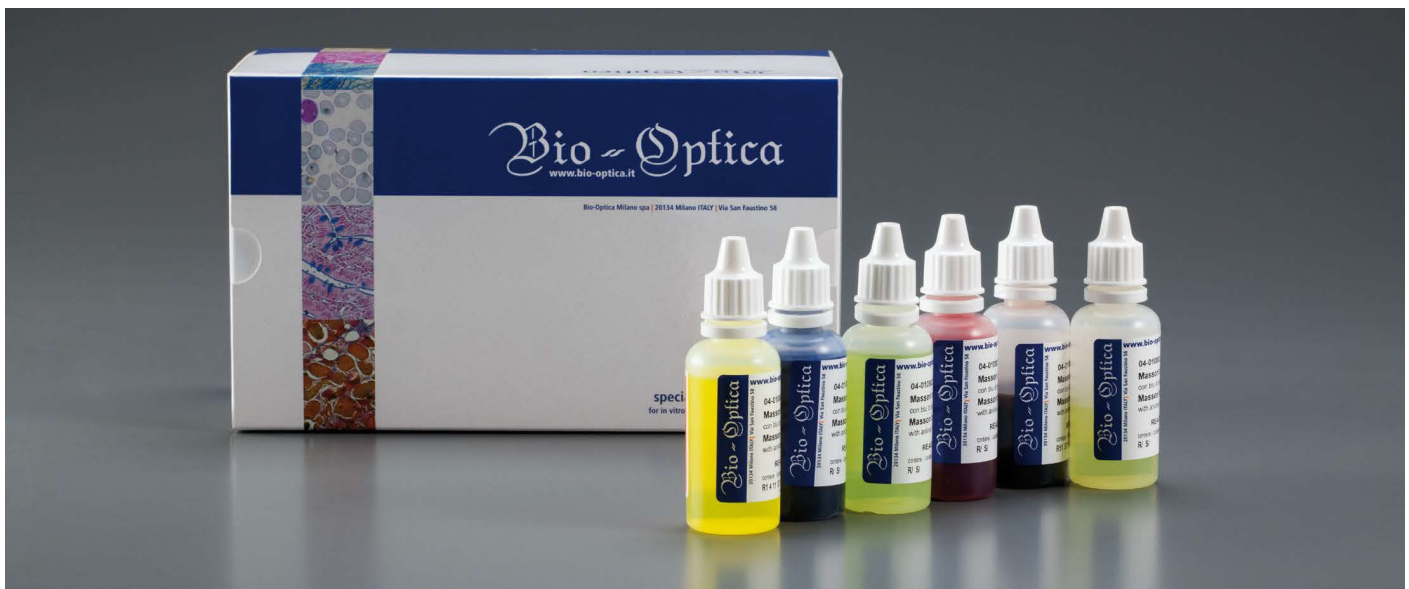
The picture is for illustrative purposes only