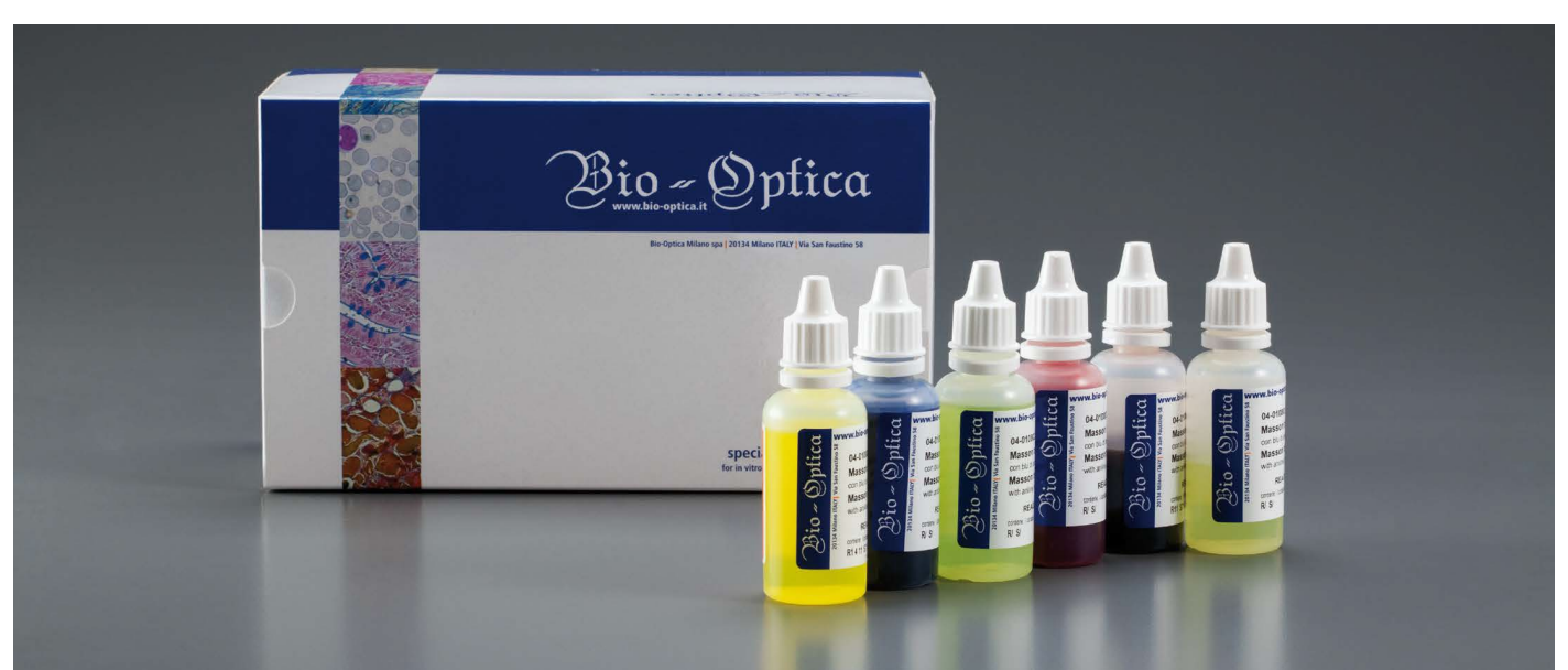
The picture is for illustrative purposes only