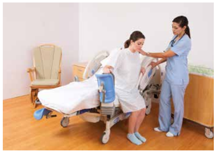
Patient-friendly grips and siderails make it easier for patients to get up and about.