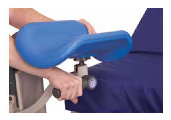
EasyGlide calf supports are larger, with a strong release lever that can be operated from any angle with one hand.