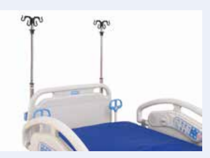
Ergonomic push handles and integrated permanent IV poles.