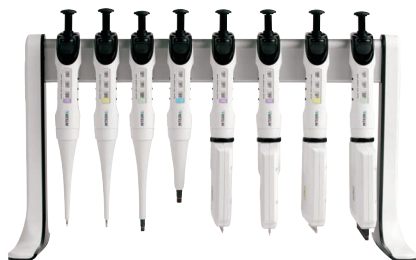
Linear stand (3215)

Storing pipettes upright is important to prevent liquid or debris from entering the tip fitting. Proper storage also extends the life of a pipette. The INTEGRA linear stand is ideal for hanging EVOLVE pipettes up off the lab bench. Up to twelve manual pipettes can be placed on a linear stand. EVOLVE shelf hooks are also available for proper storage.