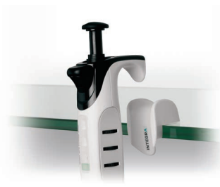
Shelf hook (3211)