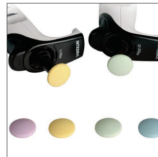
Plunger caps Color coded