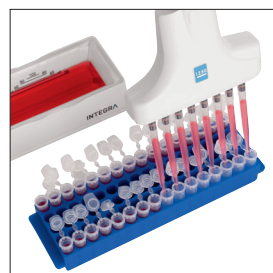
Access to tube racks