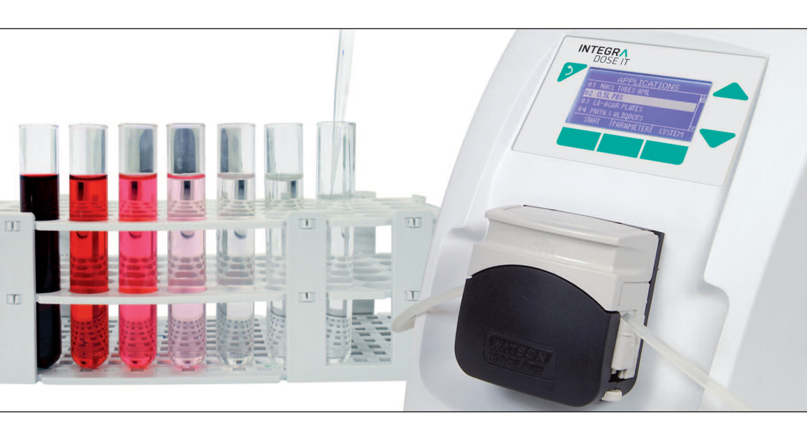
DOSE IT Compact and Easy-to-use Peristaltic Pump