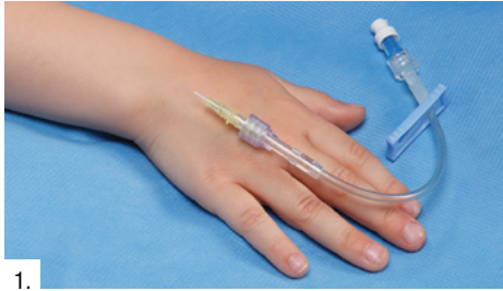
1. Insert I.V. catheter according to facility protocol.