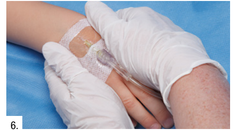
6. Smooth dressing from center toward edges using firm pressure to ensure optimal adhesion.