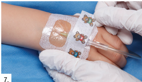
7. Using largest securement strip (found on paper frame), apply strip half firmly onto dressing at the tubing/catheter hub connection site and over to other side.