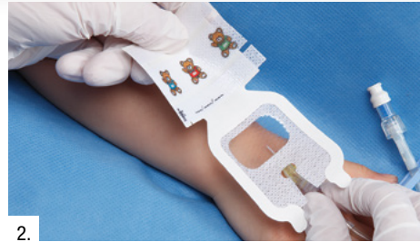
2. Hold dressing with one hand; grasp the non-adhesive portion of the dressing. Orient notch ends of dressing (the fingers of the dressing) toward the patient's fingers.