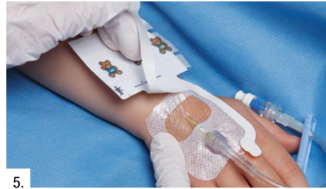
5. Slowly peel frame away from border edge while simultaneously applying firm pressure to border edge. Set paper frame aside—do not discard.