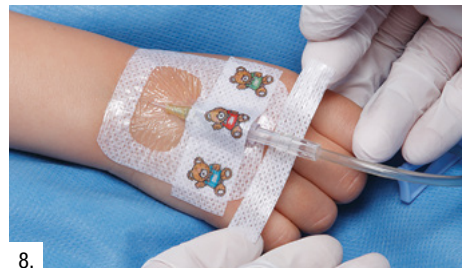
8. Use second securement strip under the tubing/catheter hub connection site. Press both strips firmly into skin.