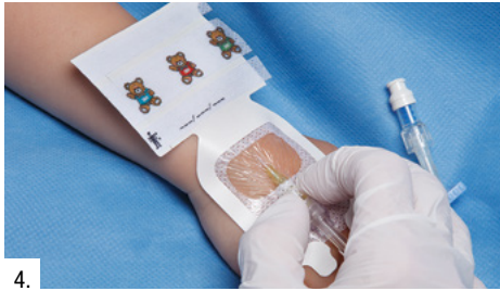
4. Apply dressing over catheter hub and use gentle but firm pressure around window border and outward toward dressing edges to secure. Gently lift tubing connection area and press border firmly underneath catheter hub.