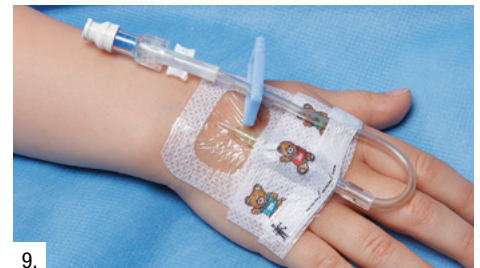
9. Loop connector tubing into place and secure with third securement strip (documentation label).