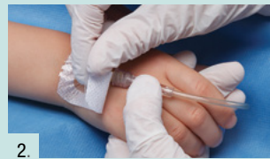
2. Gently grasp dressing edge below the keyhole notch.