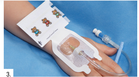
3. Position window portion of dressing over insertion site with the top of the keyhole notch lined up at the connection between the I.V. catheter hub and I.V. tubing.