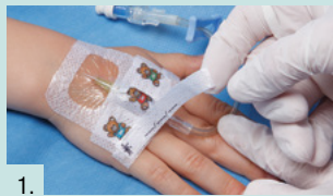
1. Remove securement strips away from dressing.