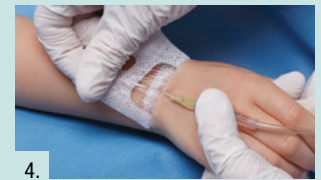
4. Peel dressing toward catheter insertion site.