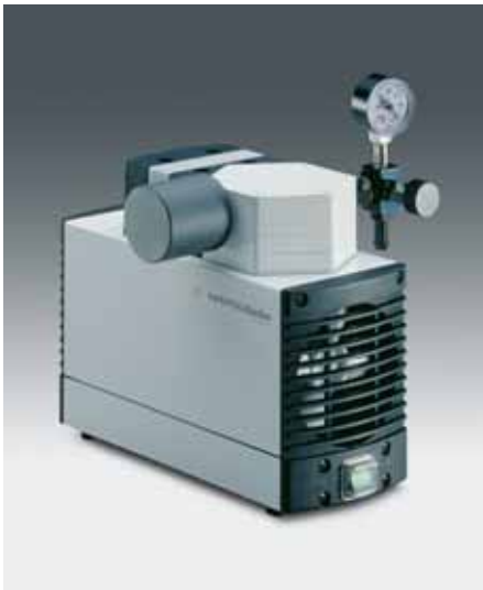
Microsart® maxi.vac Laboratory Vacuum pump 22 l/min for 3- and 6-place manifolds