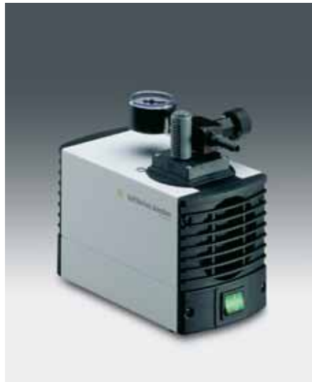
Microsart® mini.vac Laboratory Vacuum pump 6 l/min for 1-branch manifolds and individual filter holders

Microsart® maxi.vac and Microsart® mini.vac are especially designed to meet the requirements of microbiology laboratories. The absolute vacuum is limited to 100 mbar. The adjustable vacuum allows for trouble free working according to ISO 8199 ("Water quality: General guide to enumeration of micro-organisms by culture). The differential pressure during filtration should not exceed 700 mbar to allow a gentle enrichment of the microorganisms.